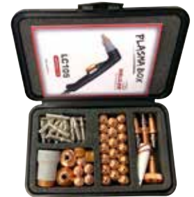
PLASMA-BOX LC105 W03X0893-115A