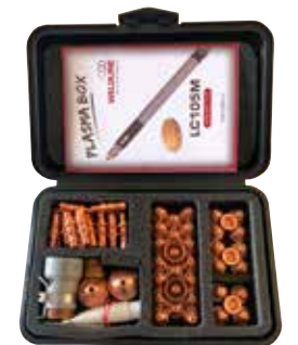
PLASMA-BOX LC105M W03X0893-117A